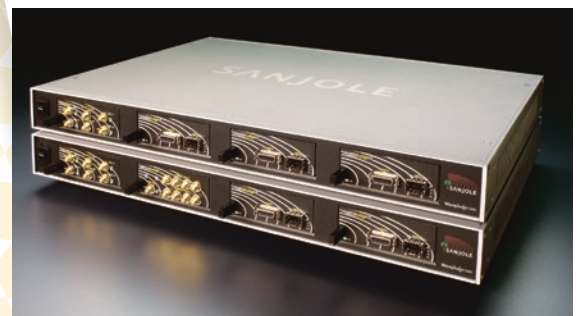
Sanjole's WaveJudge 5000

The WaveJudge defines the PHY in software rather than hardware, enabling you to quickly customize the LTE PHY to adjust to the frequent changes in PHY specifications that often occur with emerging technologies. This can be used to troubleshoot problems such as a misconfigured CQI report by editing the parameters in a live capture and then replaying it to verify that the new parameters resolve the issue.