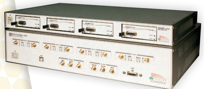
Sanjole's IntelliJudge and WaveJudge

The WaveJudge defines the PHY in software rather than hardware, enabling you to quickly customize the LTE PHY to adjust to the frequent changes in PHY specifications that often occur with emerging technologies. This can be used to troubleshoot problems such as a misconfigured CQI report by editing the parameters in a live capture and then replaying it to verify that the new parameters resolve the issue.